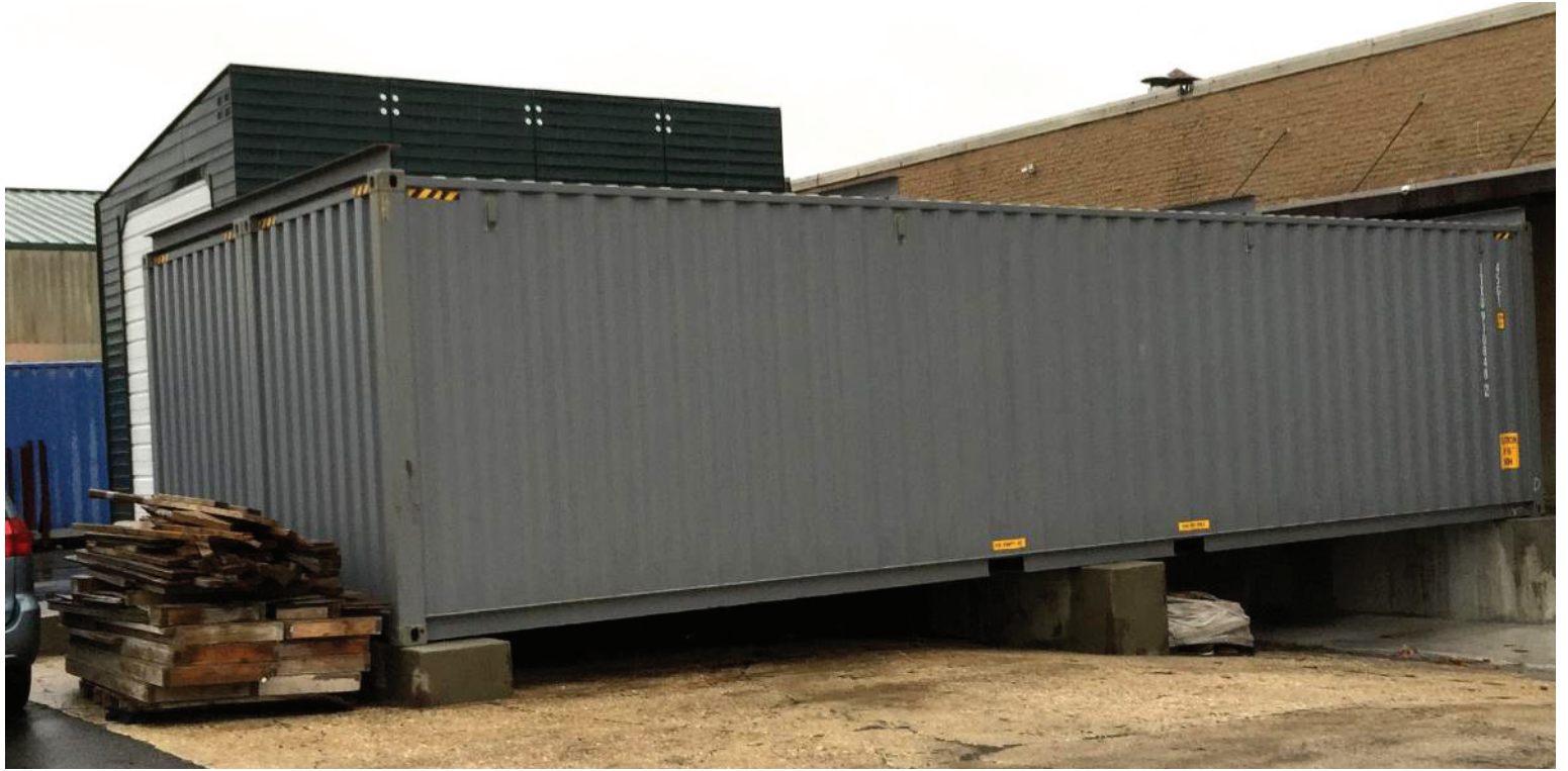
The exterior of Advanced Surface's blast booth, made of two shipping containers welded together