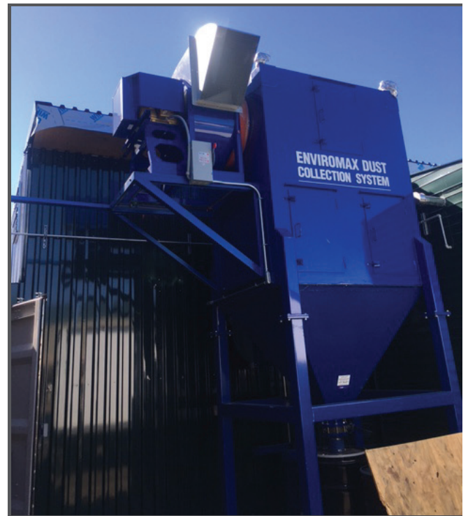
BlastOne outfitted the booth with a dust collection system to ensure worker safety and to reduce waste

BlastOne then outfitted the booth with an abrasive recovery system and dust collection equipment.