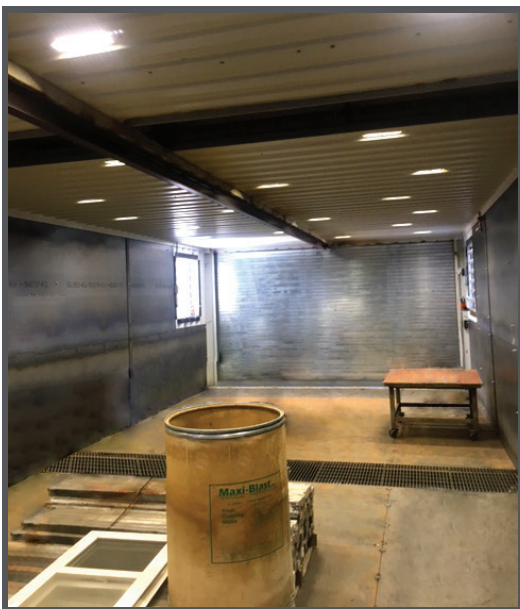
The interior of Advanced Surface's newly minted blast and paint booth