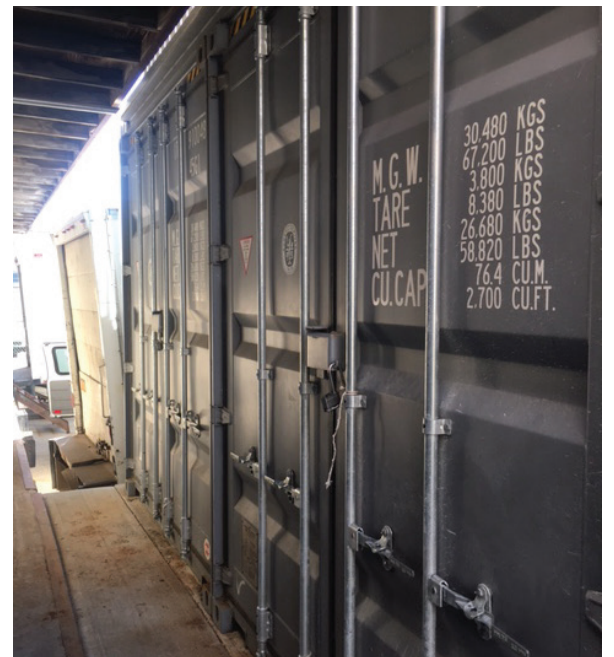
Working under extreme limitations, BlastOne and Advanced Surface curated a customized solution

Advanced Surface wanted to migrate their sandblasting operations in house to give them greater control over costs, lead-times, and service availability for their customers.