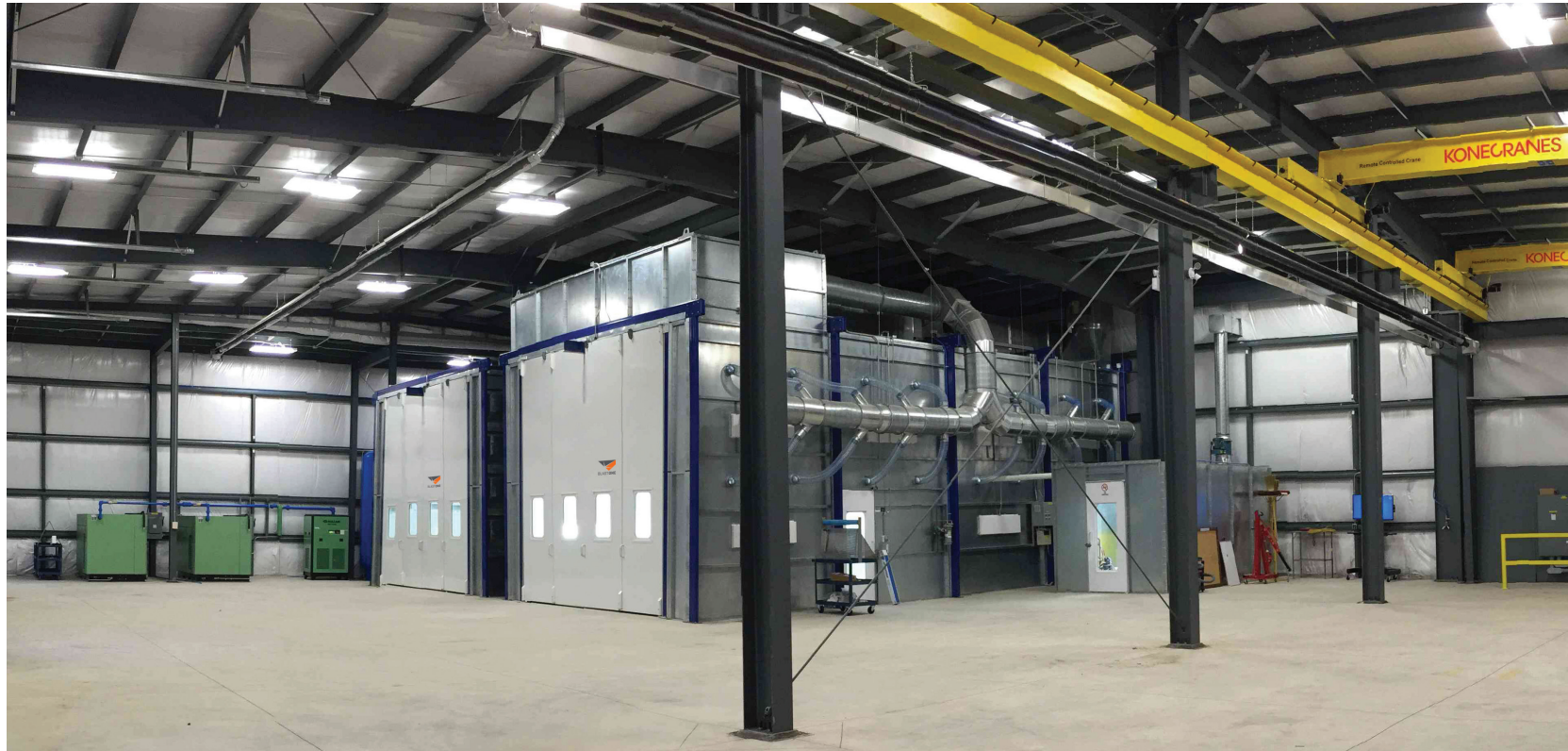
J. Oskam's newly installed blast room and paint booth positioned side by side to drive productivity.