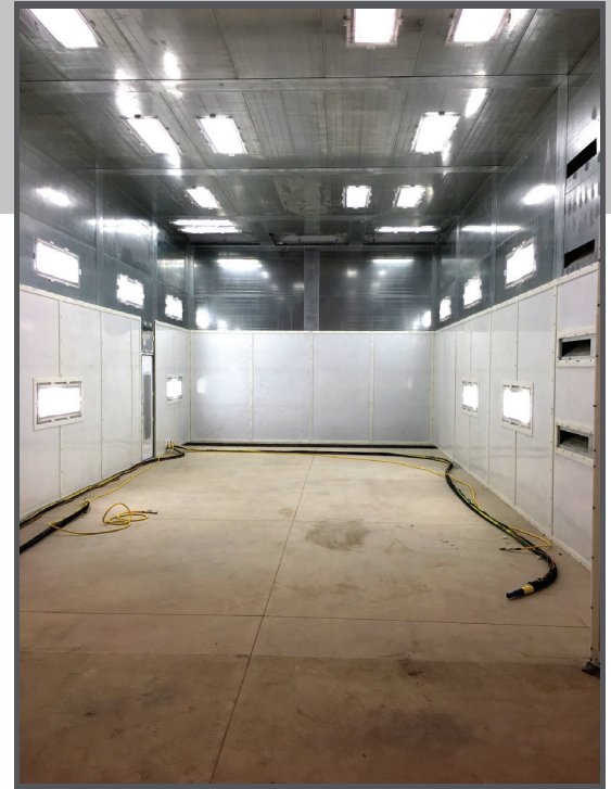
BlastOne blast room with oscillating cross conveyor and BlastWhite wall protection