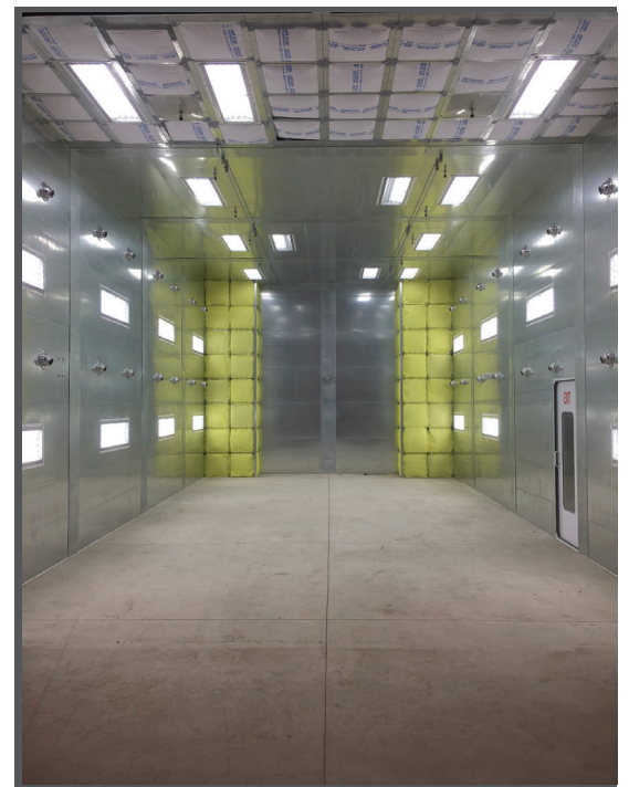
BlastOne semi-down draft wet paint booth with AquaTec curing system