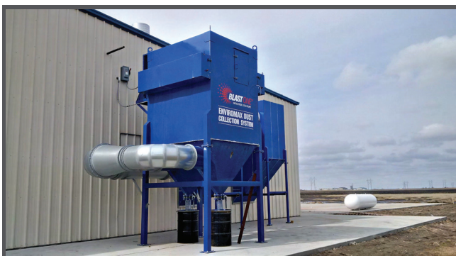
State-of-the-art Dust collection system

Nearly all manufactured materials are finished onsite, lowering project costs and increasing competitive advantages.