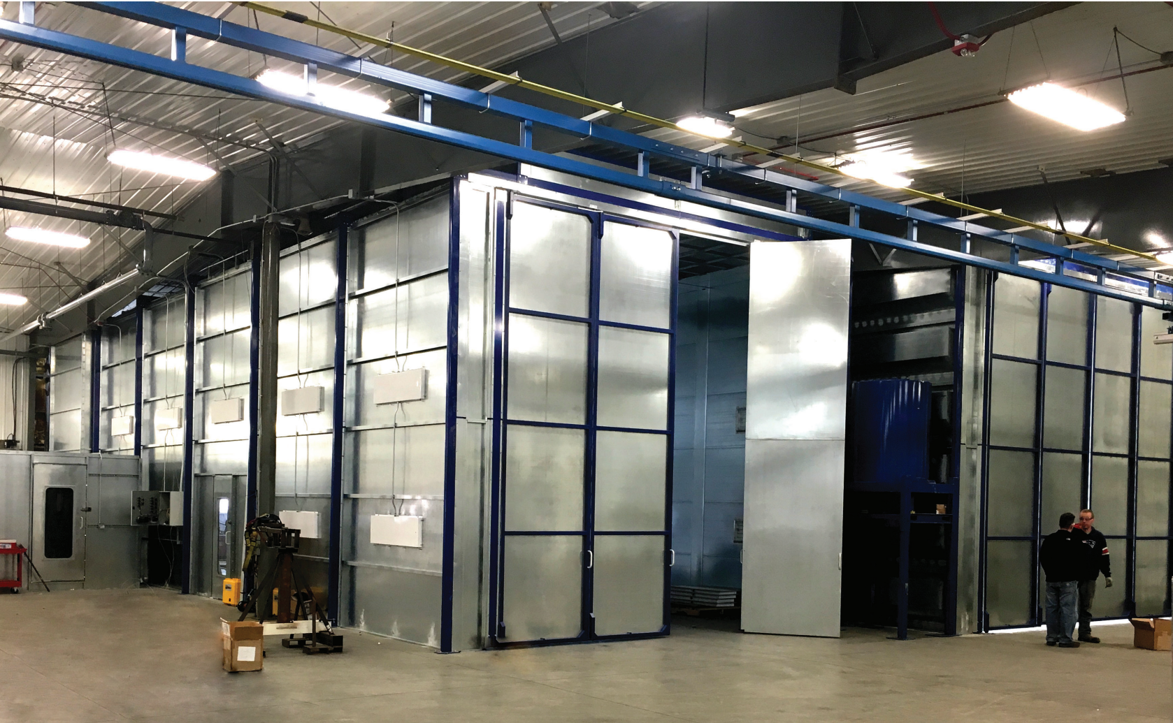
Completed inhouse finishing booths