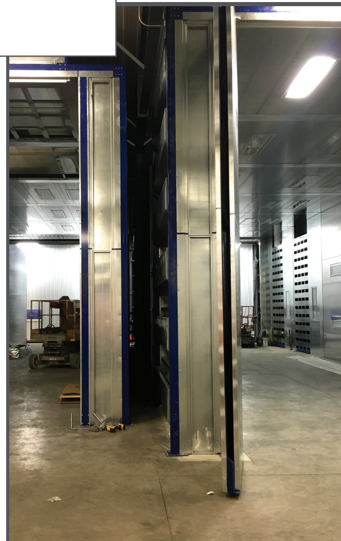
The completed booths were constructed in extremely close quarters, with less than 18" of clearance