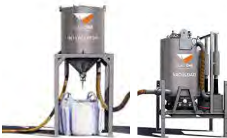
Interceptor and Vacuload 4